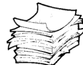
Office Paper (Papel de ofician)