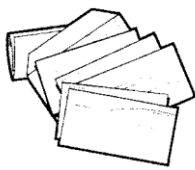
Junk Mail (Correo no deseado)