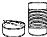
Tin or Steel Cans (Latas de fierro u hojalata)