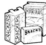
Boxboard, cake, cereal, beer and pop boxes, etc. (Carton)