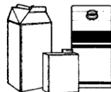
Milk, soup, broth cartons and juice boxes- Rinse and remove caps (Envases de carton de lacteos y jugos)

Please do not include food waste, films, plastic bags, plastic wrap, foam containers and cups. (No incluya residuos de alimentos: peliculas: bolsas o envolturas de plastico: vasos o recipients de uncel no basoda.